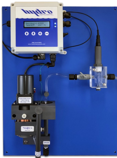
RAH-210-E (with pH Electrode)